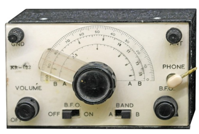
KR-022 receiver unit.