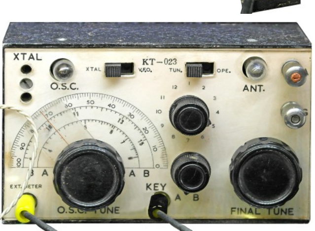
KT-023 transmitter unit.

© This WftW Volume 4 Supplement is a download from www.wftw.nl. It may be freely copied and distributed, but only in the current form.